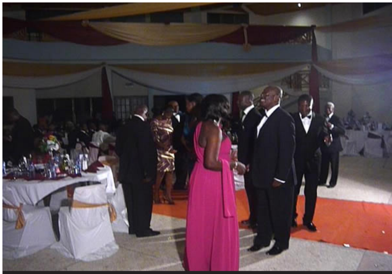
Dancing at Installation Banquet