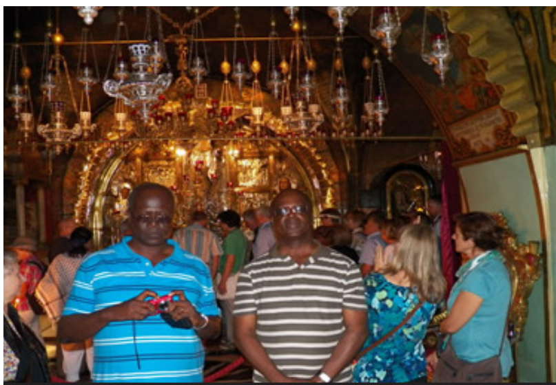
In the Church of Sepulchre-Jerusalem, at the Spot where Christ was crucified, visited during the Marshallan Pilgrimage