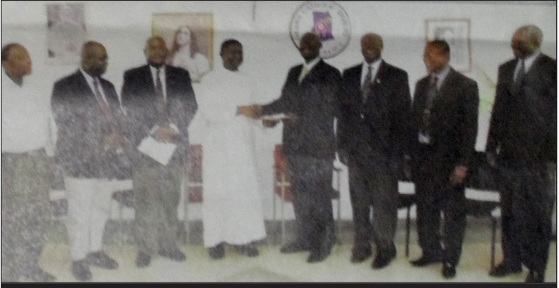
A presentation by MAREDES to support inter-ethnic clashes at Bunkpurugu-Yunyoo District in the Navrongo-Bolgatanga Diocese.