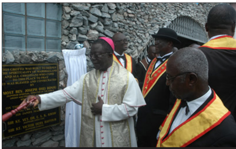
Consecration of Our Lady of Marshallans Grotto