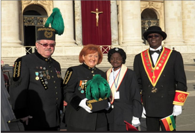
Pix with Members Of A Knidred Order At The Vatican