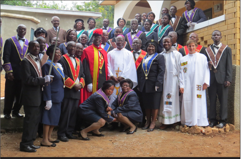
Consecration of Hermitage at Franciscans Prayer Centre, Saltpond