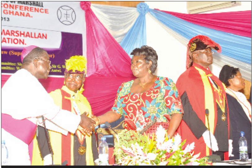
At Re-union Conference Opening Session, Kumasi, August 2013