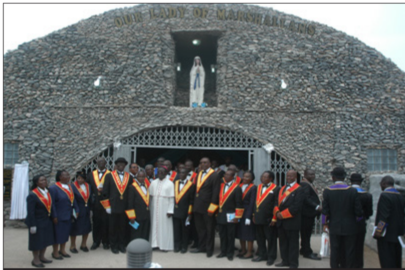
Our Lady of Marshallans Grotto