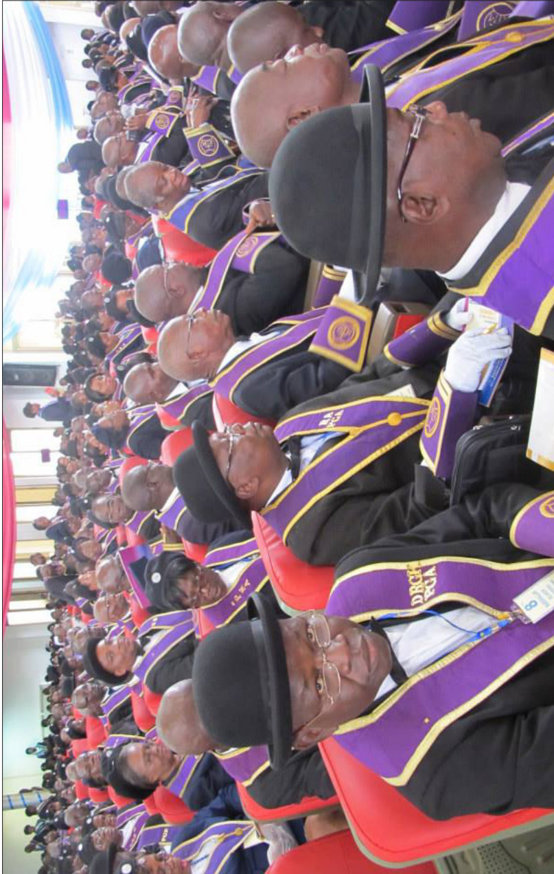
A session of the Marshallians at the Re-union Conference, Kumasi.