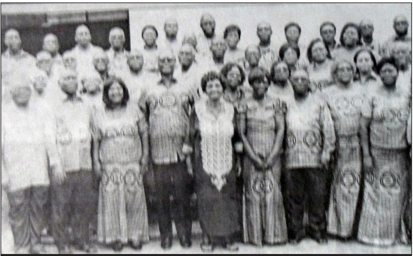
Re-launching of Mystic Psychology course - Training of Trainers workshop in Accra