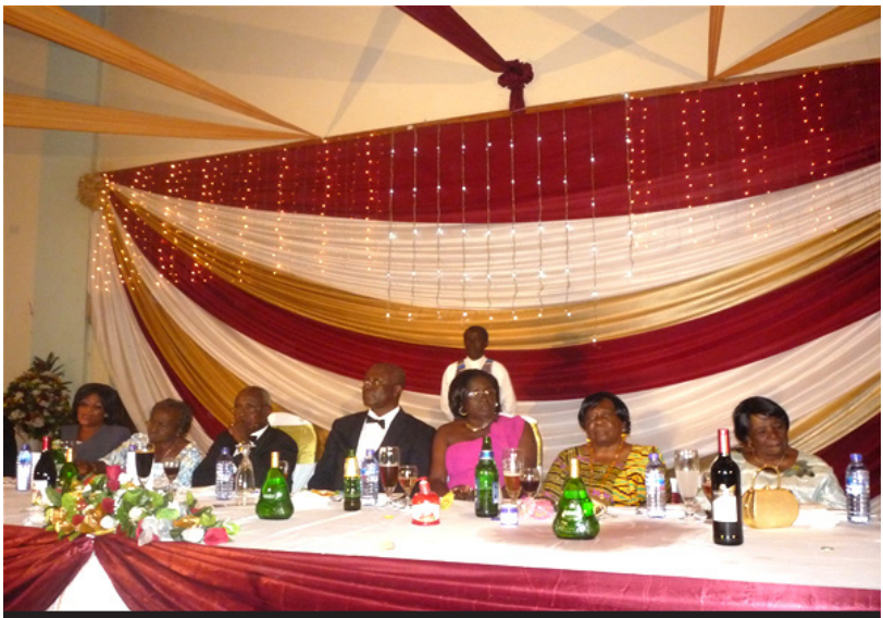
Dignitaries at Installation Banquet