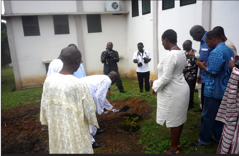
Planting of commemorative tree at Sod-Cutting of Marian Grotto, Sekondi