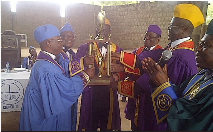
Presentation of Best Council trophy for 2012 to Council 10